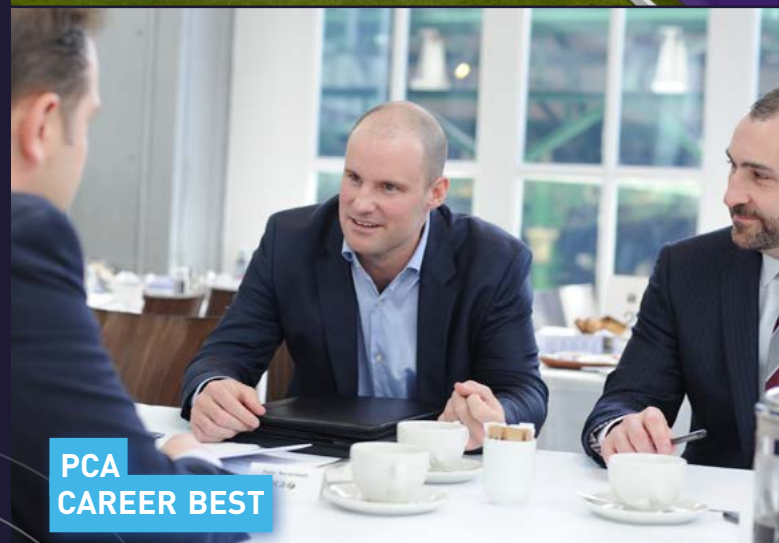
PCA CAREER BEST