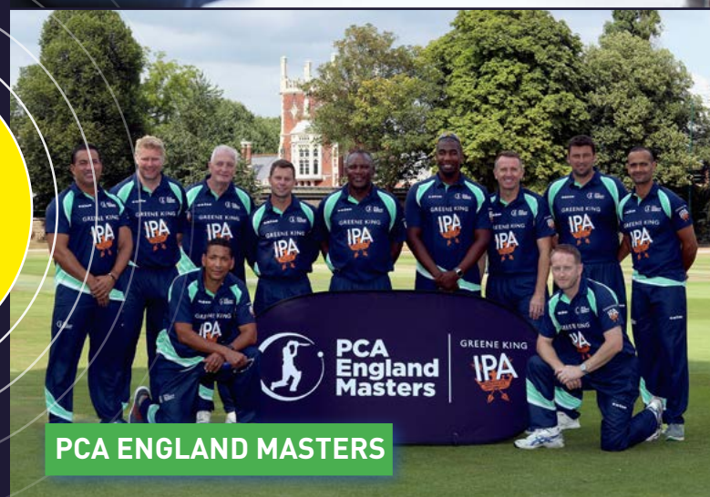
PCA ENGLAND MASTERS