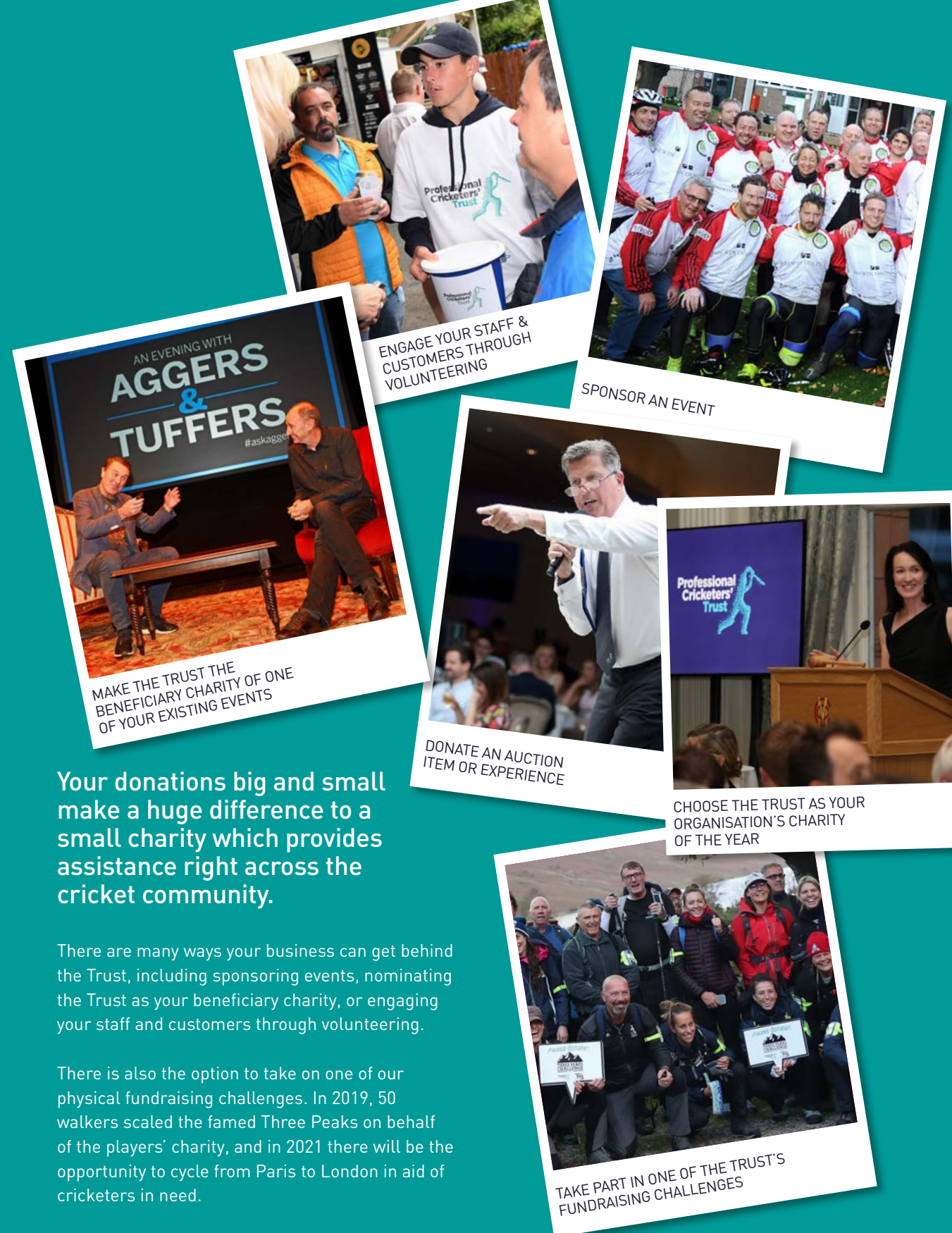
ENGAGE YOUR STAFF & CUSTOMERS THROUGH VOLUNTEERING