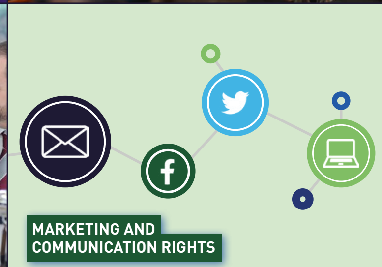
MARKETING AND COMMUNICATION RIGHTS