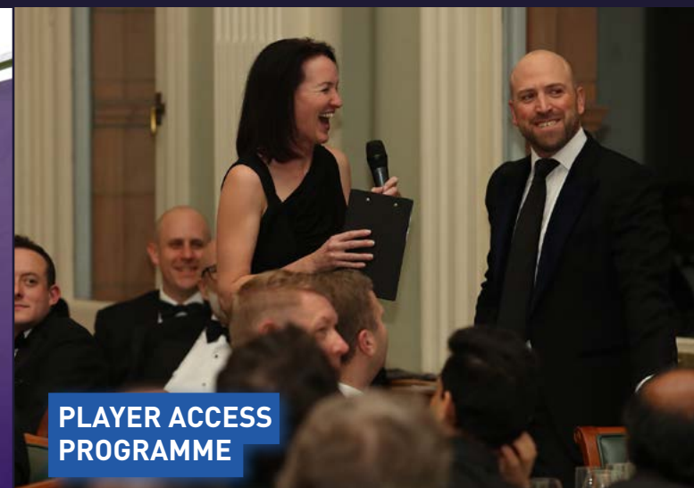
PLAYER ACCESS PROGRAMME