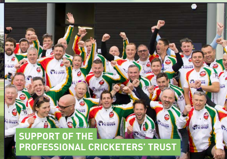
SUPPORT OF THE PROFESSIONAL CRICKETERS' TRUST